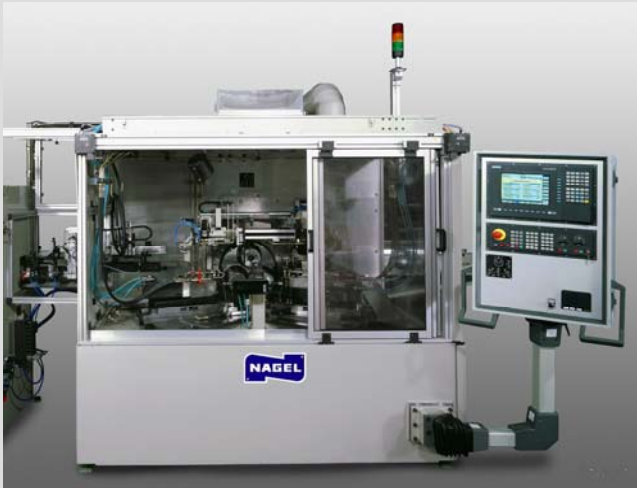
Superfinishing Machine type 2 SPHK 3 automatic loading and unloading