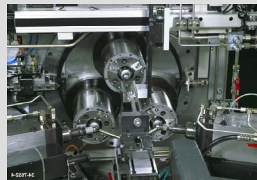
Rough and final finishing of the ball